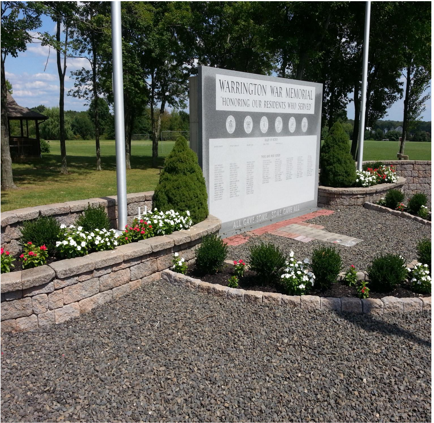
Veteran Memorial Wall Igoe Porter Wellings Memorial Field