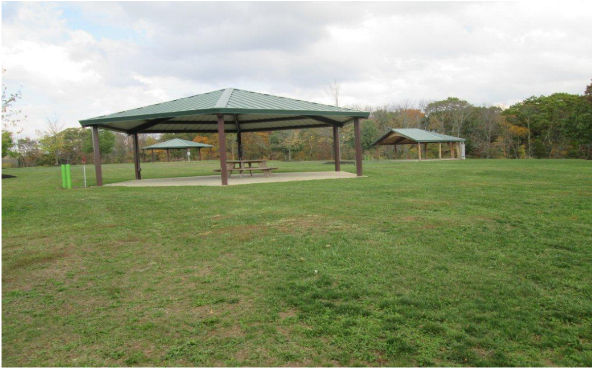
Pavilions and Band Stand John Paul Park at Lower Nike