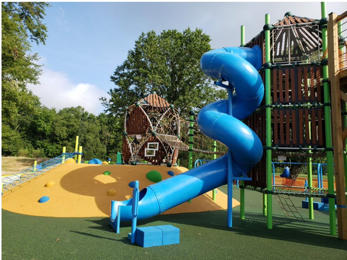
Big Slide Lions Pride Park