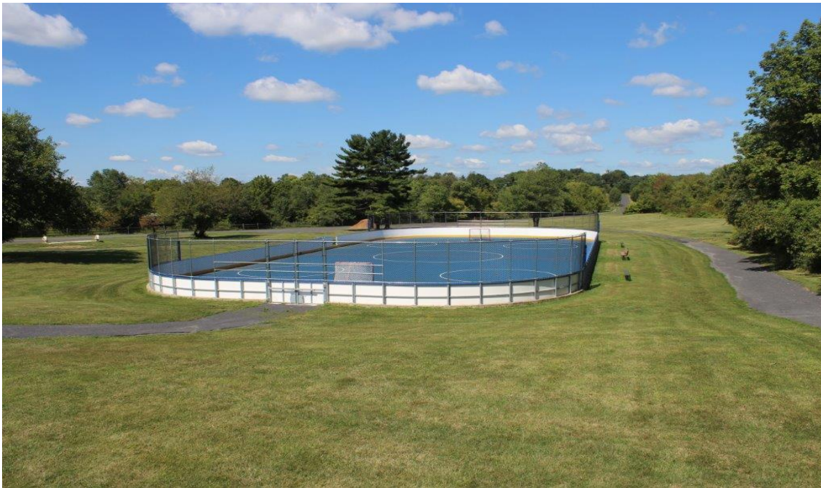
Roller Hockey Rink John Paul Park at Lower Nike

IPW (Igoe Porter Wellings Memorial Field) Pollinator Way Station