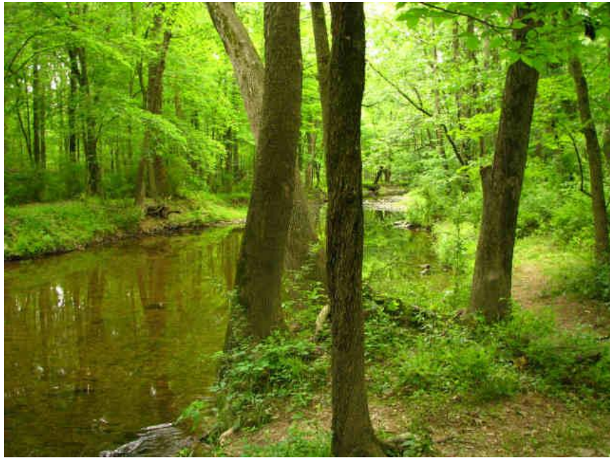
Little Neshaminy Creek John Paul Park at Lower Nike (Bradford Dam Trail)