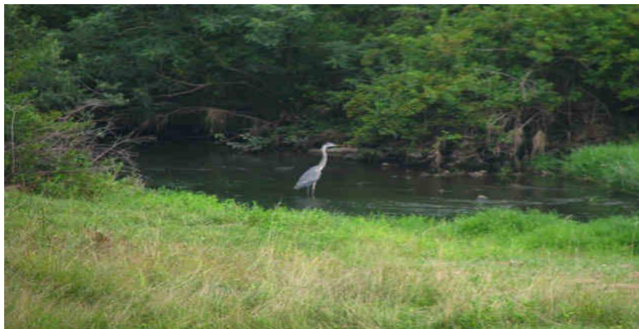
Great Blue Heron - Bradford Dam Trail John Paul Park

The Township has evolved into a commuter-oriented community, based on employment opportunities in the metropolitan Philadelphia labor market. The Pennsylvania Turnpike is approximately six miles south, and Routes 611 and 309 provide North to South transit to the metropolitan centers of Philadelphia and Trenton. Passenger transportation is provided by SEPTA as well to accommodate the volume of commuters from our Township.