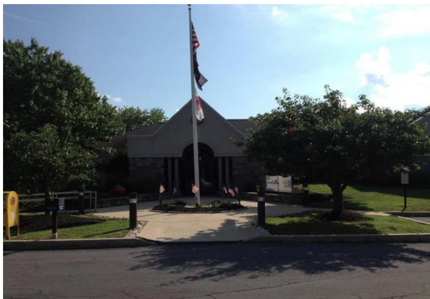
Administration Building - 852 Easton Road

New Year's Day Martin Luther King Day Presidents' Day Memorial Day Juneteenth Independence Day Labor Day Thanksgiving Day Friday after Thanksgiving Christmas Eve & Christmas Day