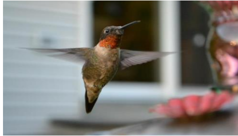
Ruby Throated Hummingbird IPW (Igoe Porter Wellings Memorial Field) Pollinator Way Station