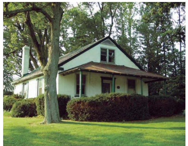
Historic Old School House – 10 Folly Rd